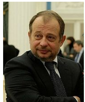
Vladimir Lisin President