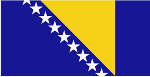
BOSNIA AND HERZEGOVINA